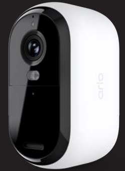
Outdoor Essential 2 Camera

With up to 15 cameras and professional installation, Pioneer helps you build a package that truly makes your sanctuary safe and secure!