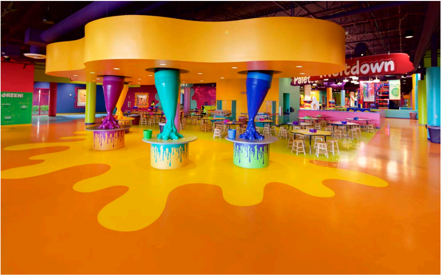
Award-winning polished flooring at the Crayola Experience in Orlando as created by Ardor Solutions.

every employee, past or present, that has worked for them.